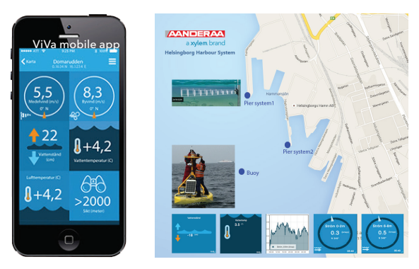
Fig 1: Overview of the placement of the buoy and the side-looking pier systems

For mechanical protection and easy maintenance the sensors are mounted inside a retractable PVC tube that penetrates the buoy hull (Figure 2). Data from the two sensors and an external compass, installed on top of the buoy away from the magnetic disturbances of the mooring chain, are logged