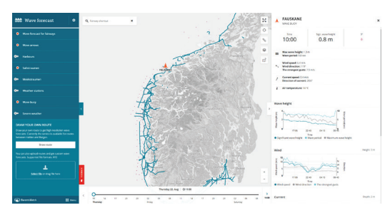
The MOTUS Wave Buoy displayed in the BarentsWatch

The BarentsWatch service provides data about many different aspects influencing coastal industries. The most important one is the wave forecasting services, but there are also warnings of polar low pressure events, current forecast for critical areas, and vessel information in and around harbors. The wave forecasts are based on models from the Norwegian Meteorological Institute as well as Notional Oceanic and Atmospheric Administration (NOAA), and has been developed by the Uni Research Polytec in close connection to the NCA and BarentsWatch. The wave forecasts cover the Norwegian coastline, but with special focus on some critical areas where special wave patterns exist. The final physical location of the MOTUS Wave Buoy was in a critical area, and the data would be assimilated in the models to improve their predictability.