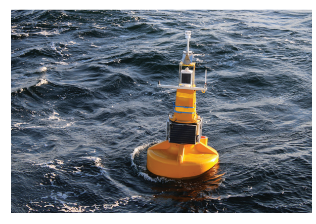
MOTUS Wave Buoy on the West Shores of Norway

"The Aanderaa MOTUS Wave Buoy is particularly important for measuring the waves and currents in the area"