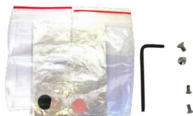
Foil Service Kit 5731